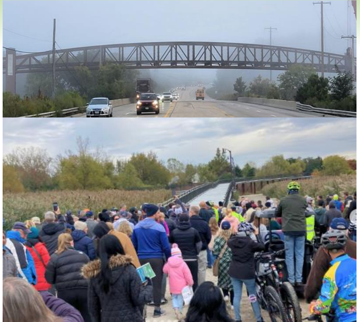
Village of Streamwood – ribbon cutting of ITEP funded bike/pedestrian bridge over Route 59 (Oct 2025)