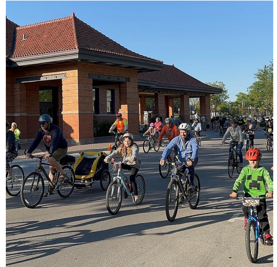
Ride Riverside Bike Month 2025