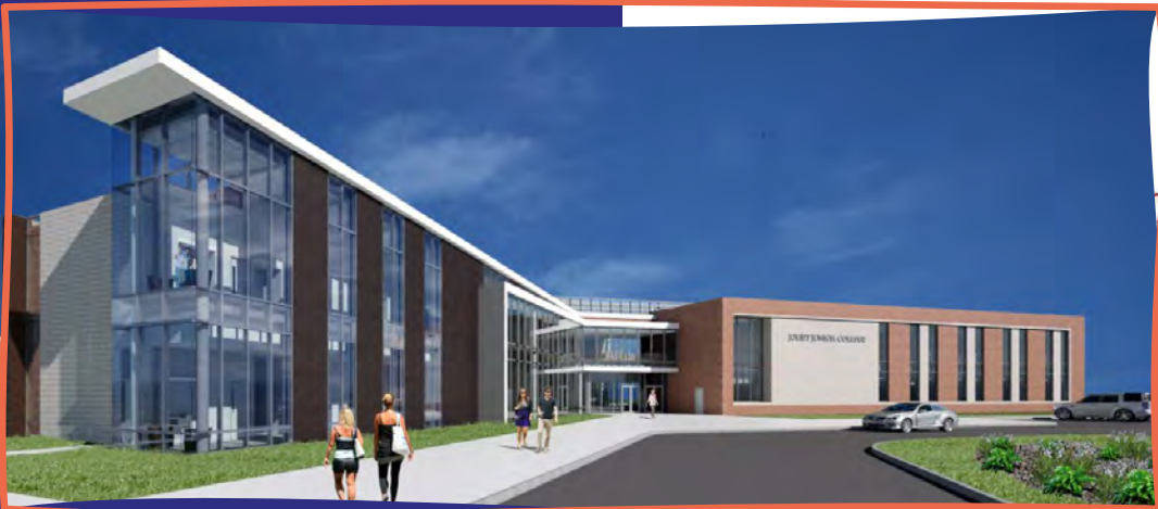
Romeoville North Campus