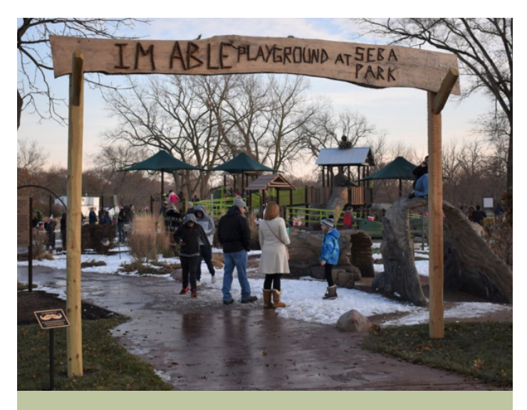
The I'm Able Playground at SEBA Park

Similarly, the Parks & Recreation Department, which already maintains facilities and offers 'Aged to Perfection' and other older adult-serving programs and activities, should be engaged to play an even more integrated and significant role in supporting Aging-in-Community. The Parks & Recreation Department will play an ongoing key role with its leadership in the development of the new Community Center (discussed below).