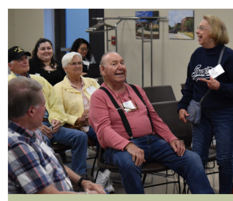
The residents shared a wealth of lived South Elgin experience

Churches and other places of worship play a substantial role supporting the community's older adults and their caregivers. Faith community representatives might be invited to participate in the new Aging-in-Community Commission. Similarly, the business community should be pursued as a partner, as residents speak of their desire to be better engaged with local retail and commercial businesses.