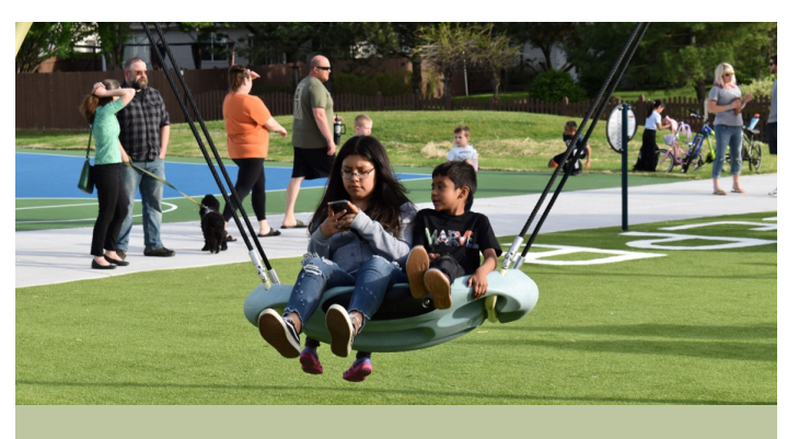
One of South Elgin's many neighborhood parks