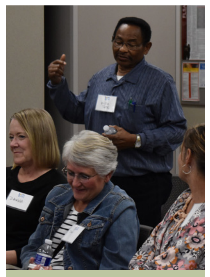
Resident interactions were the highlights of Workshop #1

Planning engagements often include an assessment of a community's assets and challenges. The limited AiaCR scope required an informal streamlined assessment process, in which Planning/Aging spoke with community stakeholders, reviewed guidance documents such as the community's Comprehensive and other plans, and other available, relevant municipal information. In addition, residents and key internal and external stakeholders