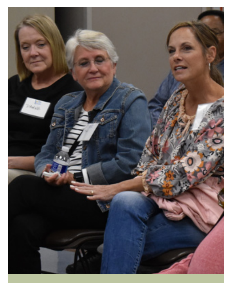
Multi-generational South Elgin

The makeup of South Elgin's population helps explain the importance of taking a strategic approach towards Aging-in-Community. As shown below, South Elgin's population is currently younger than Kane County's overall population. South Elgin's current 65+ (its 'older adult' population) makes up just 10.1% of the total population, compared to 13.7% in overall Kane County. But South Elgin's current 35 through 64 (its 'middle aged' population) cohorts constitute 45.5% of the total population, significantly more than Kane County's 39.8% 'middle aged' population. This suggests that as its current 'middle aged' population transitions into older adulthood, joining many of those remaining in this cohort, South Elgin's 65+ population share may reach ~40-50% by the early 2040s. Assuming that the absolute numbers of older adults will be in this range, the only thing that may lower the overall percentage of South Elgin's population would be a significant influx of younger families.