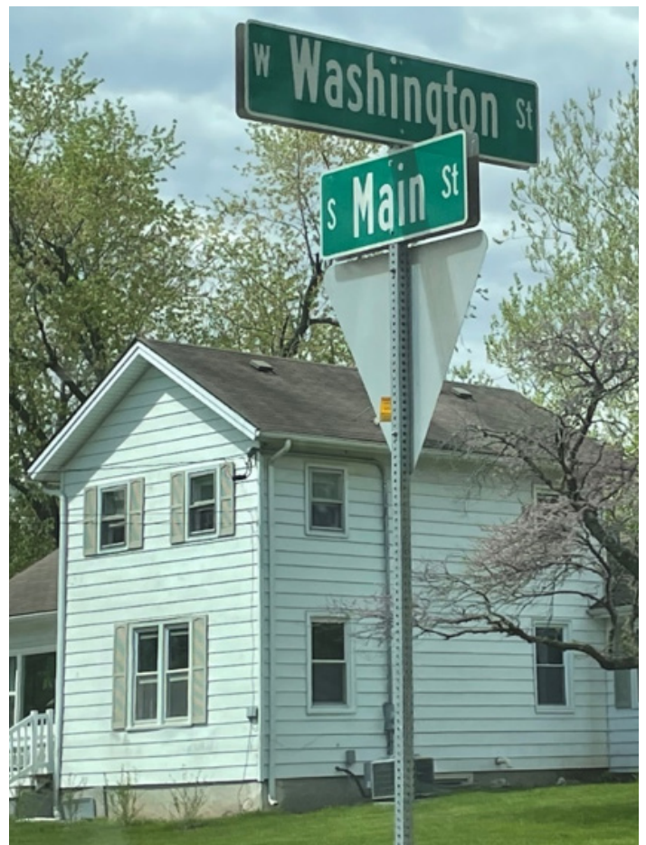
Some of Yorkville’s oldest houses are well into their second century of occupancy

Yorkville should express and promote its support for Aging-in-Community/Lifecycle Living more visibly, as a true commitment to Aging-in-Community/Lifecycle Living is not obvious in some of Yorkville’s communications, including but not limited to the City’s website. A clear statement such as “Yorkville is committed to Aging-in-Community/Lifecycle Living!” could set the tone, followed by a continuity of commitment and purpose on appropriate following or linked pages.