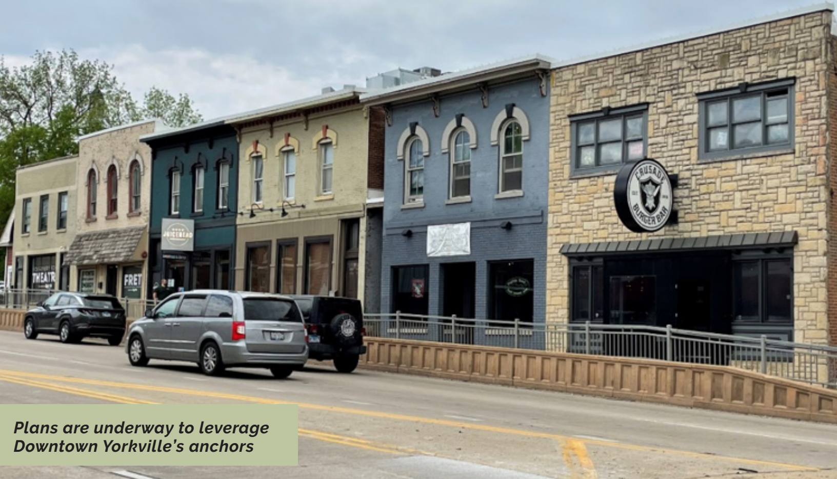
Plans are underway to leverage Downtown Yorkville's anchors