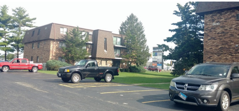
Yorkville also has a few low-slung multi-unit developments