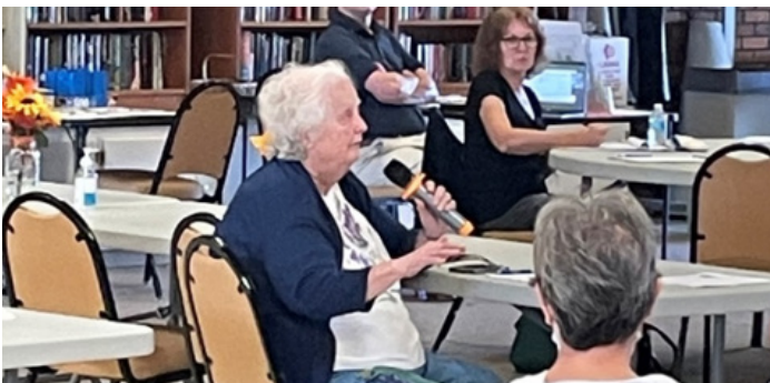
Receiving resident input at Workshop #1

The highlights from this collected resident and stakeholder input were presented, along with facilitated discussions that were the core of the workshops: engaging residents to share their lived experiences and ideas as to how they think the community would be able to support them in the future; and internal and other key stakeholders to consider ways they might be able to augment or modify their services and strategies to better support Aging-in-Community going forward.