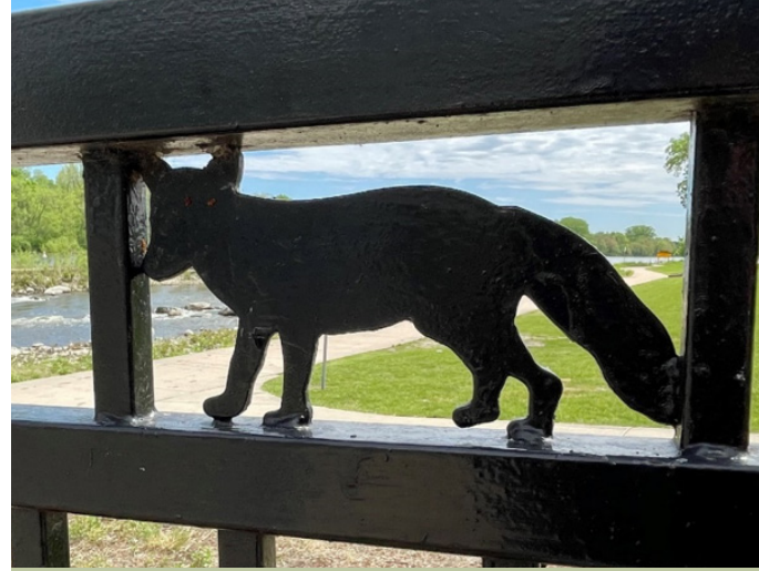
Yorkville clearly has the Fox River in its heart

Yorkville's residential neighborhoods vary in terms of housing types, and the neighborhoods themselves fall into one of two main types. The City's Future Land Use Map differentiates between “Traditional Neighborhood Residential” ( spanning the Fox River on both sides of Bridge Street ) and “Suburban Neighborhoods” ( much of the residentially zoned property on throughout Yorkville ). The Traditional Neighborhoods consist of homes primarily spaced on smaller lots on rectilinear gridded streets that meet at intersections, while the Suburban Neighborhoods often consist of larger houses on lots located on curvilinear streets that often end in cul-de-sacs. Suburban Neighborhoods are generally internally focused and replete with parks and greenways, paths and trails, and water features, while Traditional Neighborhoods are more externally focused, and often rely on adjacent or nearby institutions for their recreational needs. The current draft Unified Development Ordinance, while eliminating minimum lot sizes, maintains the distinction between what it refers to as “Traditional Residence” and “Suburban Residence” districts.