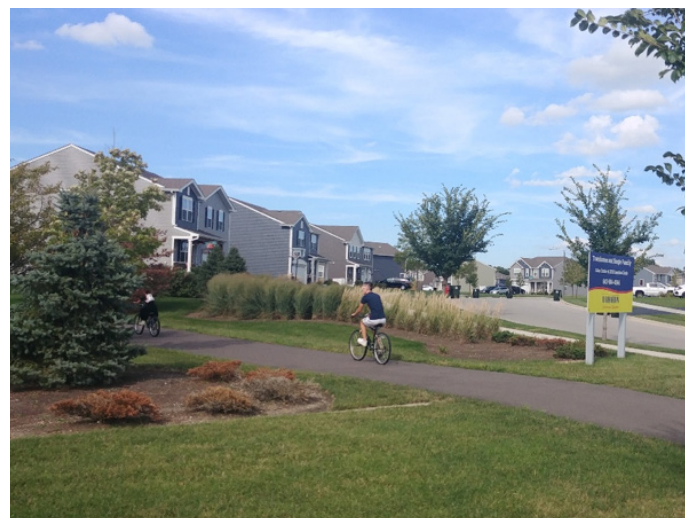
Many new/recent neighborhoods incorporate path and trail networks