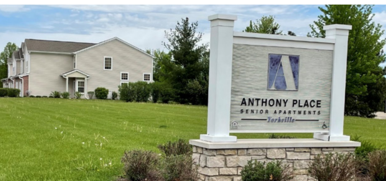
Yorkville features the affordable Anthony Place older adult development

Much of Yorkville's commercial core is at or near the intersection of Bridge Street and Veterans Parkway, with the civic campus along Game Farm Road nearby. The physical distance between these key civic amenities and much of Yorkville's residential population, and the need to cross one or both major vehicular thoroughfares to access them, is one factor contributing to Yorkville's disconnectedness.