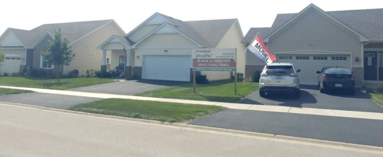
Some recent infill developments target the older adult downsizing market