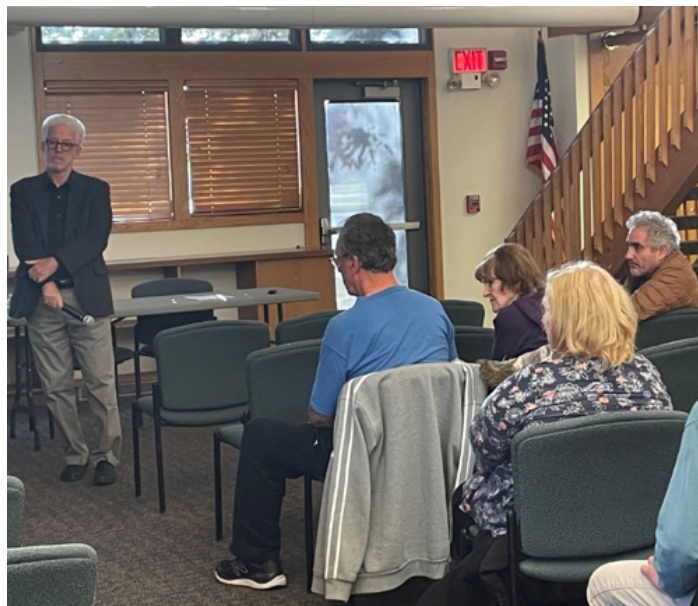
The engagement between attendees was a particular Workshop #2 highlight

Community would include timely access to food, medicine, and emergency services, a range of appropriate housing options, affordable transportation options that include door-to-door service, healthy eating and affordable exercising opportunities, wellness options, and social connectivity