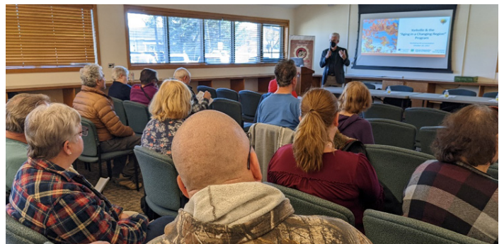
The Workshop #2 audience shared much meaningful input