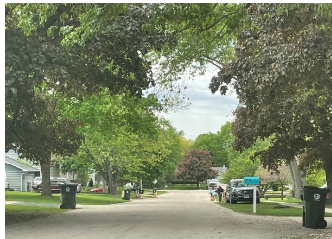
Many of Yorkville's traditional neighborhoods are just south of the Fox River