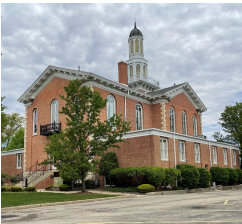
The historic county courthouse perches majestically above Downtown Yorkville

to date, and assistance they envisioned to help advance these goals. The 2022 Cohort of municipalities – Bellwood and Broadview ( participating jointly ), Highland Park, Maywood, Richton Park, and Yorkville – reflects the region's diversity in terms of geography, socio-economic factors, community type, and Aging-in-Community experience.