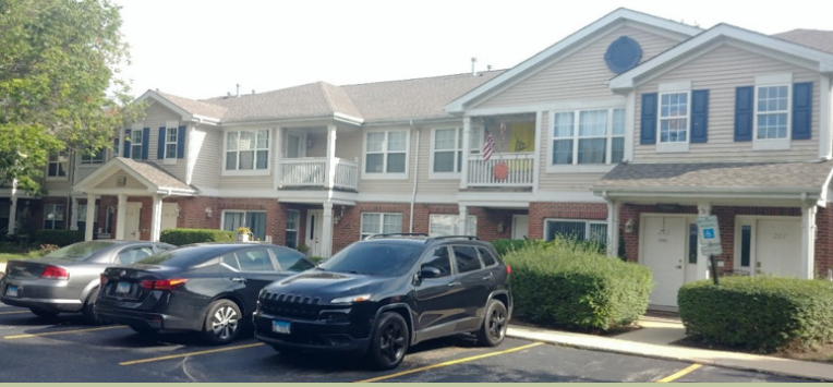
Yorkville contains a handful of townhome developments