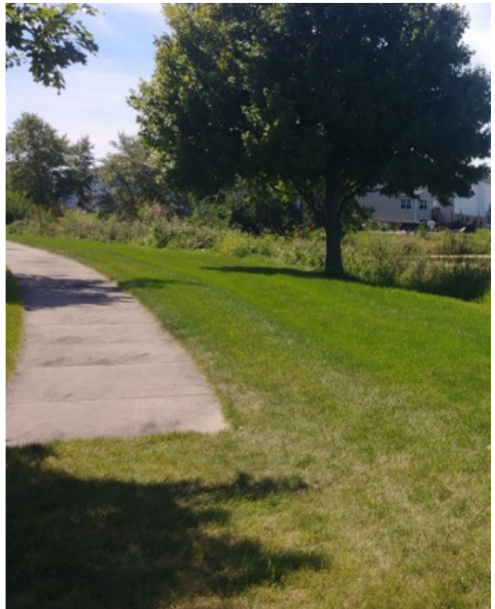
Community connectivity will require closing some public sidewalk gaps

The phrase "Missing Middle Housing" refers to a spectrum of house-scale buildings with multiple units in walkable neighborhoods, some of which might fit Yorkville's housing needs and support Aging-in-Community/Lifecycle Living. It could be a valuable exercise to utilize the Missing Middle Housing framework and check the